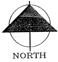
Exhibit Map SERRANO