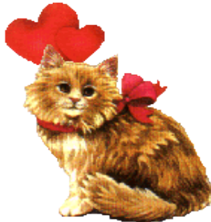
Happy Valentine's Day

Future City entitlement approvals may include, but are not limited to, use permits, approval of tentative parcel and subdivision maps, design review, and development agreements between the City and future project applicant(s). ~