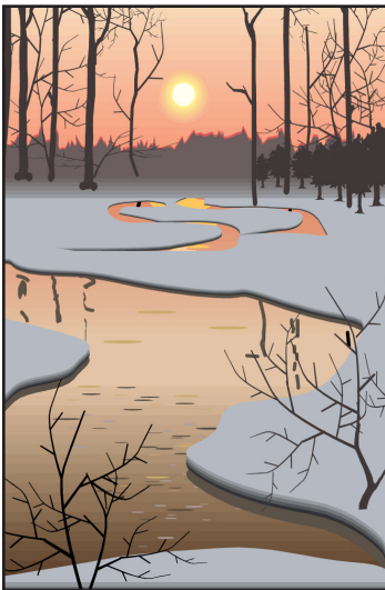
Afternoon in February

Use these handy consumer tips to become a smarter shopper. ~