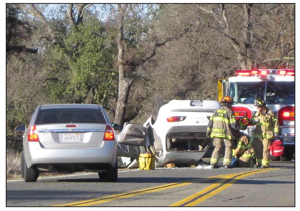
Recent Wreck at Bass Lake Curve - An unidentified southbound motorist evidently lost control of his car last month when attempting to negotiate the sharp turn in Bass Lake Road near Madera. Persons who sustained injuries were taken away by ambulance.