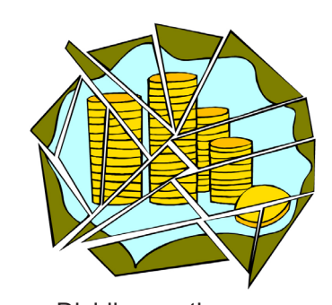
Dividing up the money