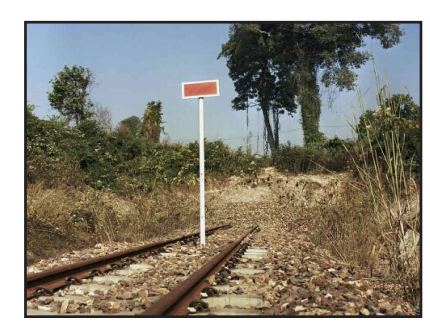
The end of the tracks

So if the supervisors increase Latrobe FPD's tax allocation, they must also decrease the size of the county general fund's tax allocation. ~