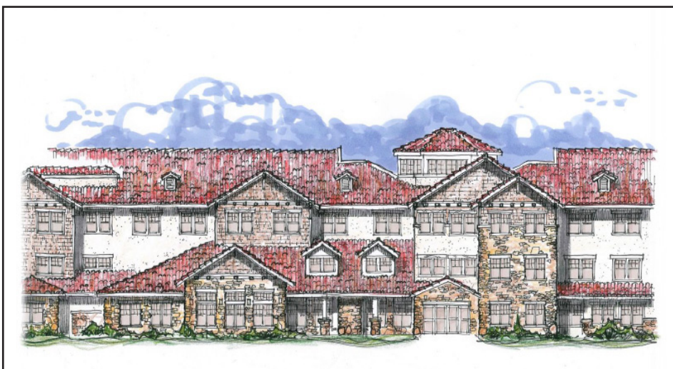
Architect's depiction of the design of the 130-unit retirement center to be built in Town Center West in El Dorado Hills

No dates were given as to start of construction or completion. ~