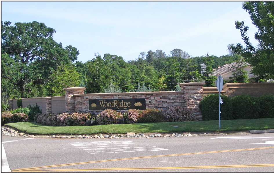
The entry and landscaping for the Woodridge neighborhood is maintained by an annual assessment that is administered by the El Dorado Hills Community Services District