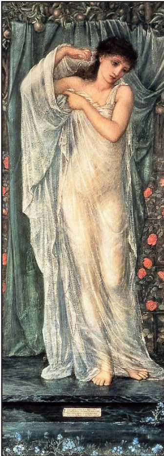
The Seasons - Summer — Edward Burne-Jones

Fairest of the months! Ripe summer's queen The hey-day of the year With robes that gleam with sunny sheen Sweet August doth appear.