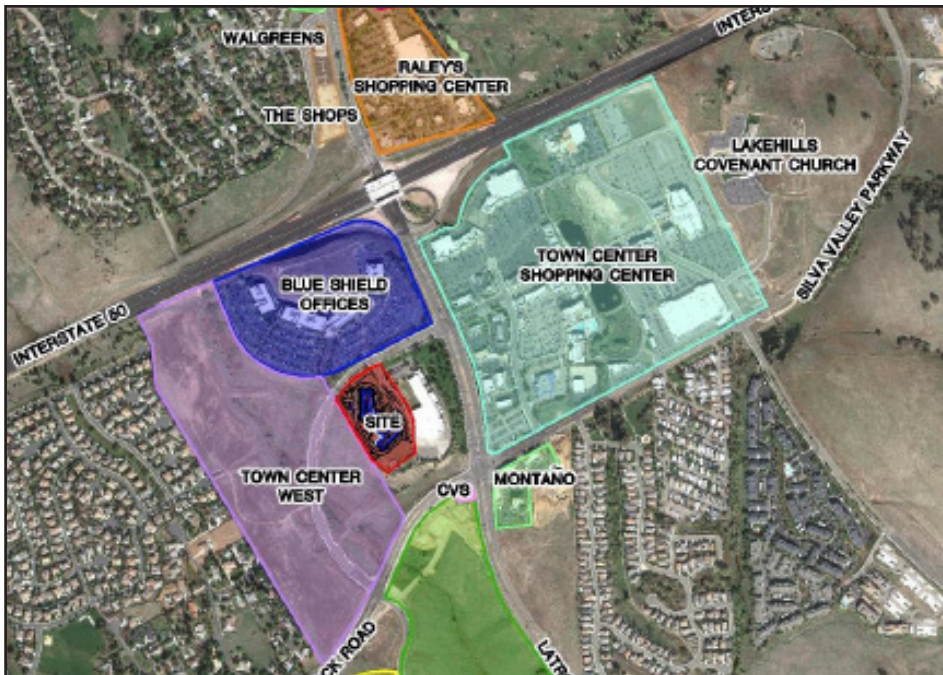
Map showing the location of the approved 130-unit retirement center to be built in Town Center West in El Dorado Hills (in red)