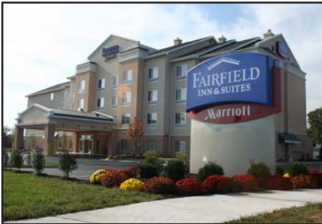
Typical Fairfield Inn & Suites