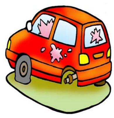
Don't let this happen to you!