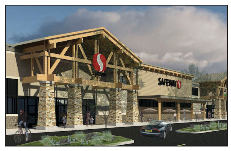
Example of a typical Safeway store