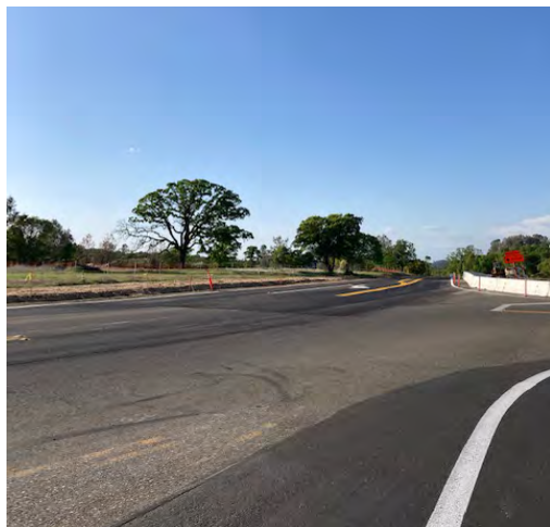
Bass Lake Road at Madera Way

Residents should expect to see more education and enforcement efforts going forward. A community meeting is expected in the coming months to discuss concerns and solutions.