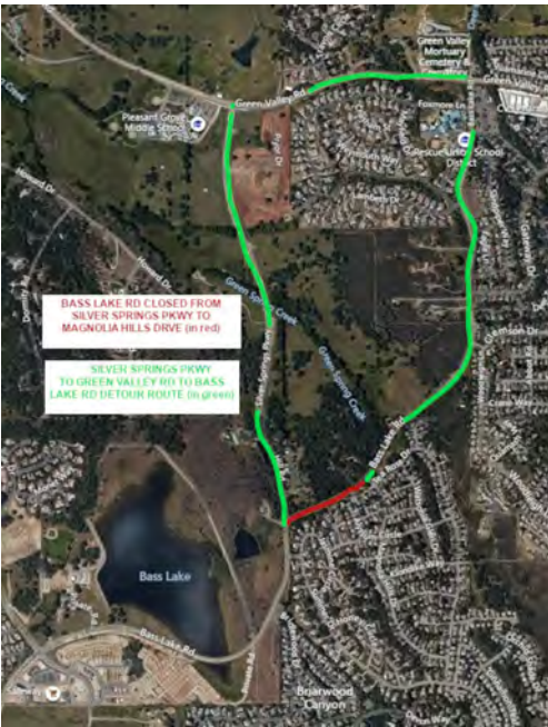
Bass Lake Road Closure Map

Changeable Portable Reader board signage will be in place to advise motorists of changing conditions and delays. Currently the changeable portable reader boards indicate that the closure is expected to be in place from April 13th through June 11th - the completion date is subject to change due to weather delays, and possible utility relocation delays from PG&E and AT&T.