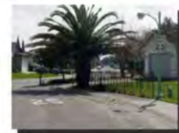
Example of a Tier I Traffic Calming Treatment from the El Dorado Hills Fire Department Traffic Calming Standard Addendum 12-06-2016