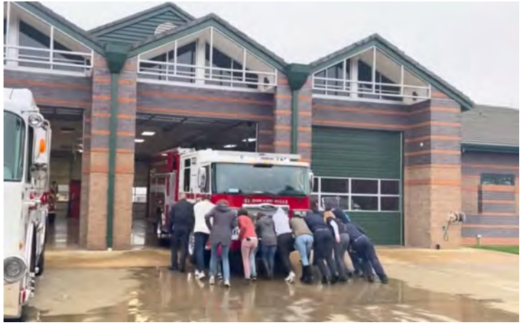
Engine 86 Roll-In Ceremony November 17, 2021 - Station 86 Bass Lake Road

And true enough, EDH Fire shared on their social media accounts on November 18th, that new ENGINE 86 was welcomed into Station 86 on Bass Lake Road with the traditional Roll-In ceremony - and then was put right to work.