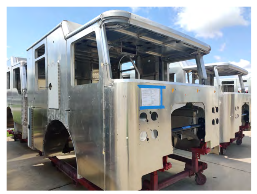
EDH Fire Engines 84 & 86 under construction at Pierce Mfg Factory in Appleton Wisconsin, July 4th 2021.