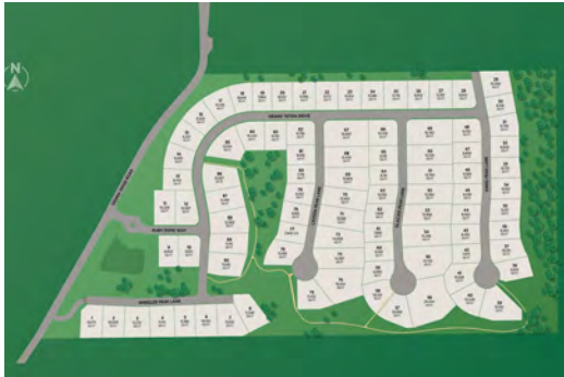
Hidden Ridge 90 home lot map: Sienna Ridge Rd at Hawk View Rd

Prices are starting at the upper $900,000 range. Toll Brothers indicates that their on-site Sales center will be opening soon.