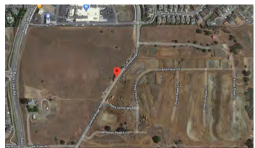
Click Image to load a larger map

Street names inside the gated project include: Wheeler Peak LN, Ruby Dome WY, Grand Teton DR, Lassen Peak LN, Glacier Peak LN, and Kings Peak LN.