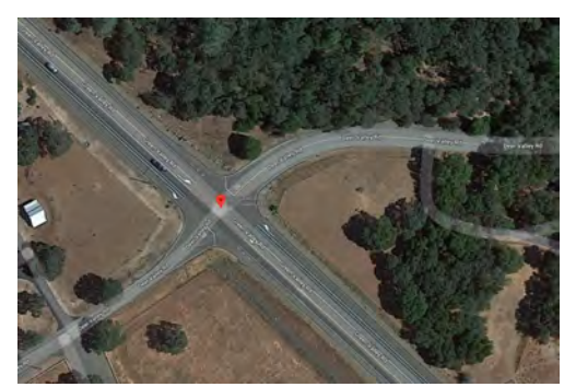
2021 - Green Valley Rd-Deer Valley Rd intersection after 2014 improvements

Blue Mountain Communities purchased the Summer Brook property in 2021, and are currently developing the approved 29 residential lots. They also purchased the Silver Springs property across Green Valley Road in 2018, and are currently developing 37 homes in phase 1 of the Revere at Silver Springs project.