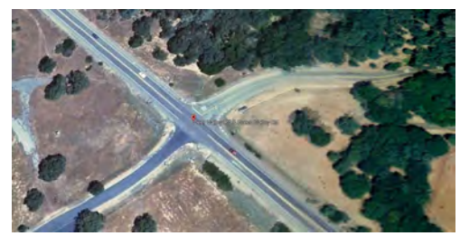
2008 - Green Valley Rd-Deer Valley Rd intersection prior to 2014 improvements

Improvements to the Green Valley Road – Deer Valley Road intersection were completed in 2014 along with the addition of the Green Valley Road – Silver Springs Parkway Intersection/signalization project, conditioned by the approval of the Silver Springs residential development, which satisfied elements of CIP Project No. 66114 which included the intersection widening to provide for right and left tum channelization and acceleration/ deceleration lanes.