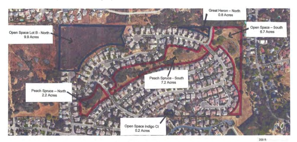
WOODRIDGE OPEN SPACE MAINTENANCE ASSOCIATION OPEN SPACE AREAS