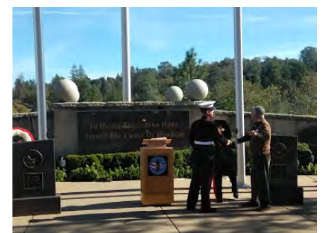
El Dorado County Veterans Monument 360 Fair Way Placerville, CA 95667