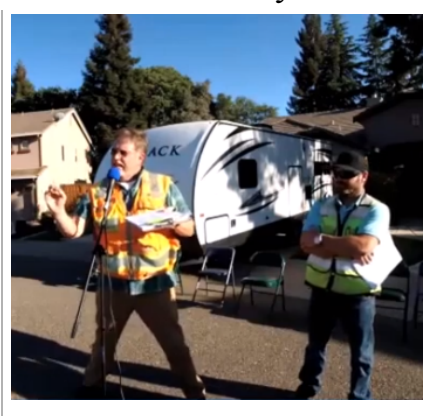
May 2021 Bass Lake Villages Community Traffic Safety Meeting