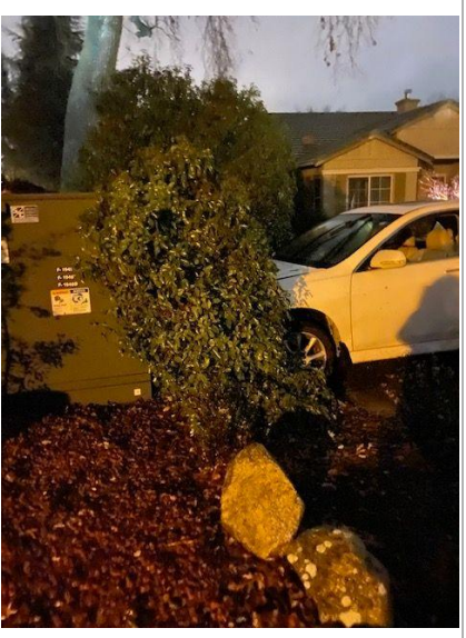
Latest Summer Drive Accident: January 2023