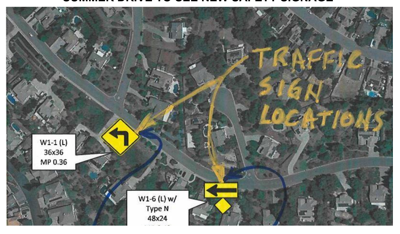
New Advance Curve Warning Signs suggested for Summer Drive between Honey Circle and Basil Court