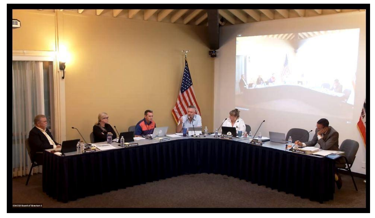
EDH CSD Board of Directors May 11, 2023 meeting EDH incorporation discussion