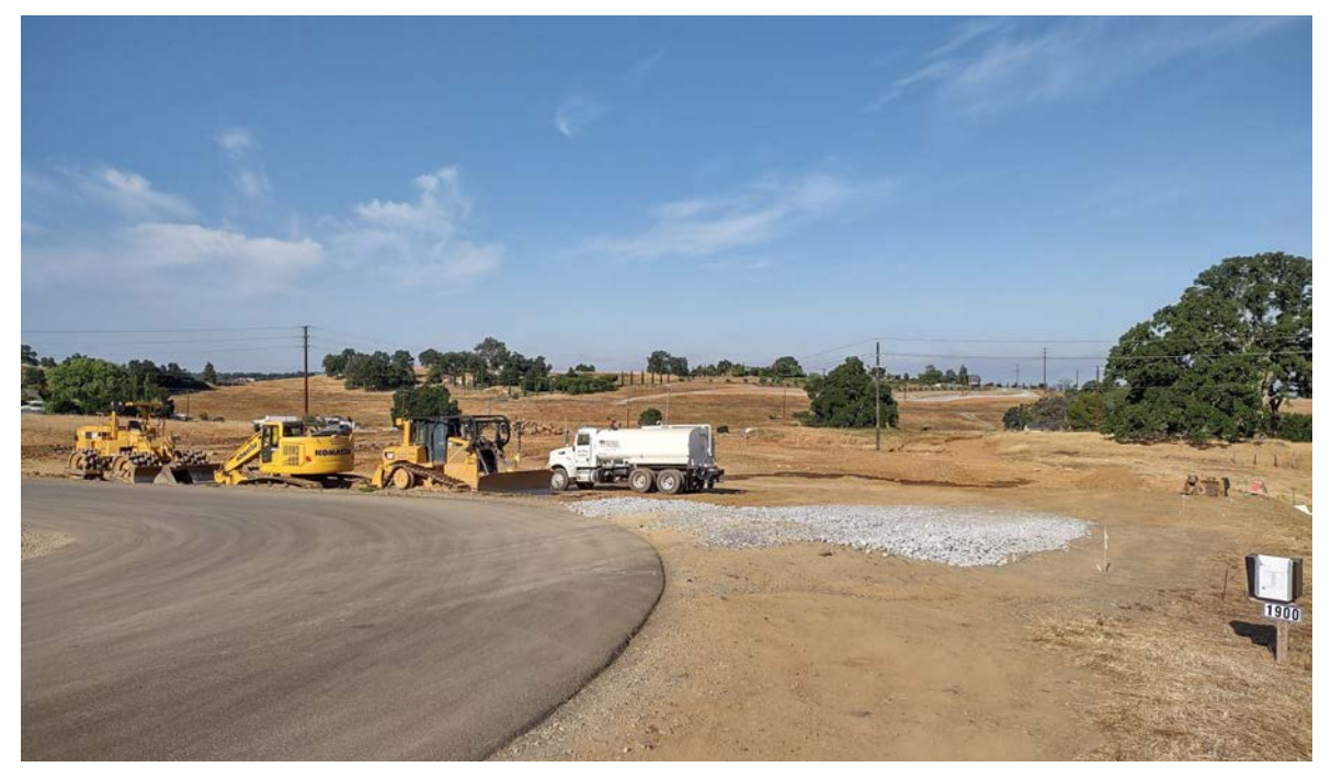
Future El Dorado Transit Park & Ride facility, Old Bass Lake Road at Country Club Drive