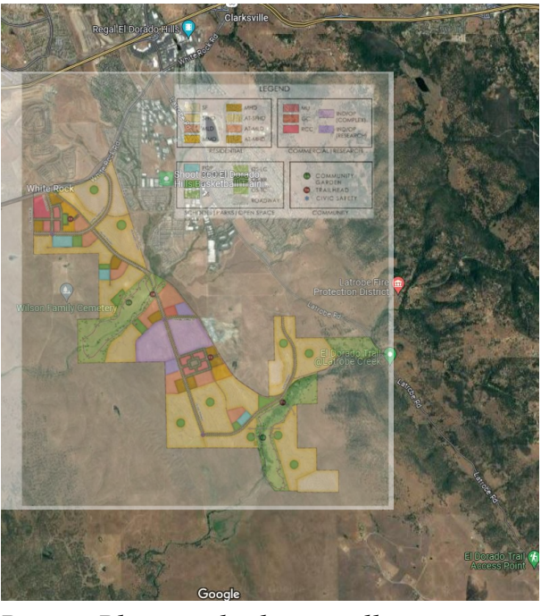
Project Plan overlaid on satellite map