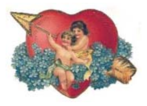
VALENTINE'S DAY FEBRUARY 14TH