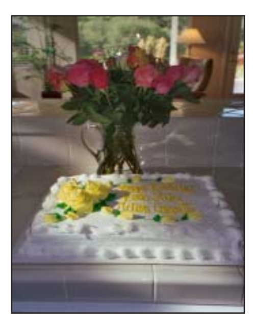
The Birthday Cake

Sports advocates are expected to attend the meeting in an attempt to influence the CSD Board to proceed with the park as planned.