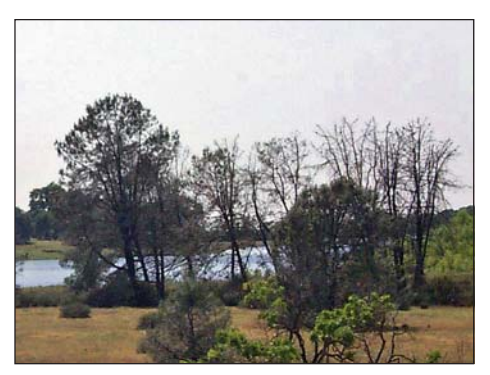
Part of Bass Lake Regional Park Site

BLAC may endorse political campaigns and may take political positions because it is incorporated as a 501(c)(4) nonprofit organization. More information on the "Yes on Cityhood, Yes on Measure P" campaign may be found at www.edhcity.org. ~