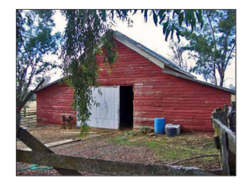
Old Clarksville schoolhouse, now a barn

Further news on the shopping center will be reported in the Bulletin when it becomes available. ~