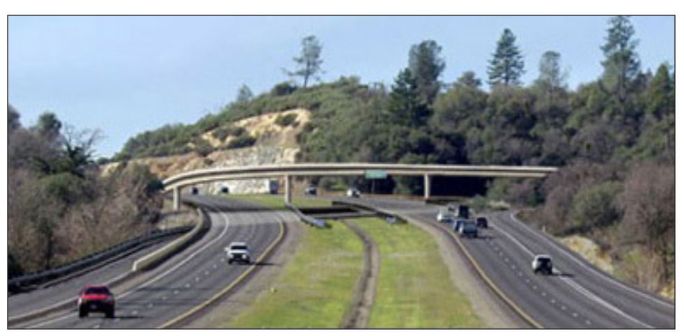
Artist's conception of Shingle Springs Rancheria interchange looking west

Wal-Mart is now seeking approval of a plan for expanding the existing Wal-Mart on Riley Street without closing the store. With the proposed expansion, the store would be 153,678 square feet and include 852 parking spaces. The expanded store would include a full grocery department in addition to general retail sales. The remodeled store is proposed to be open 24 hours a day, seven days a week. ~