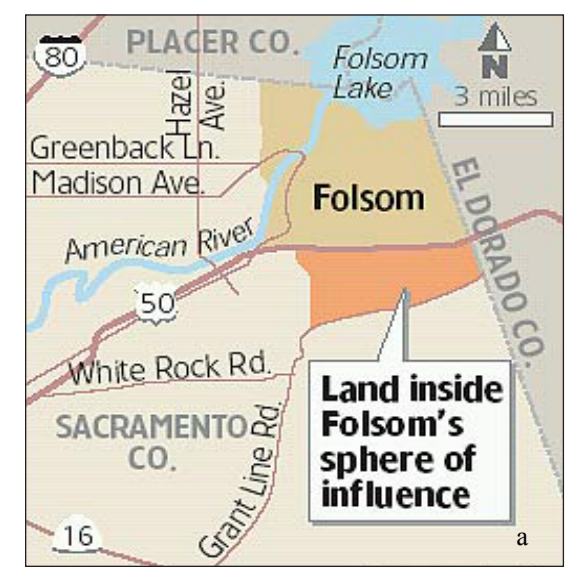
Folsom seeks to annex 3,500 acres of land