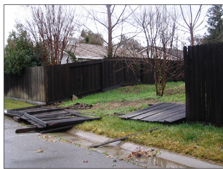
Examples of fence damage from recent wind and rain storms