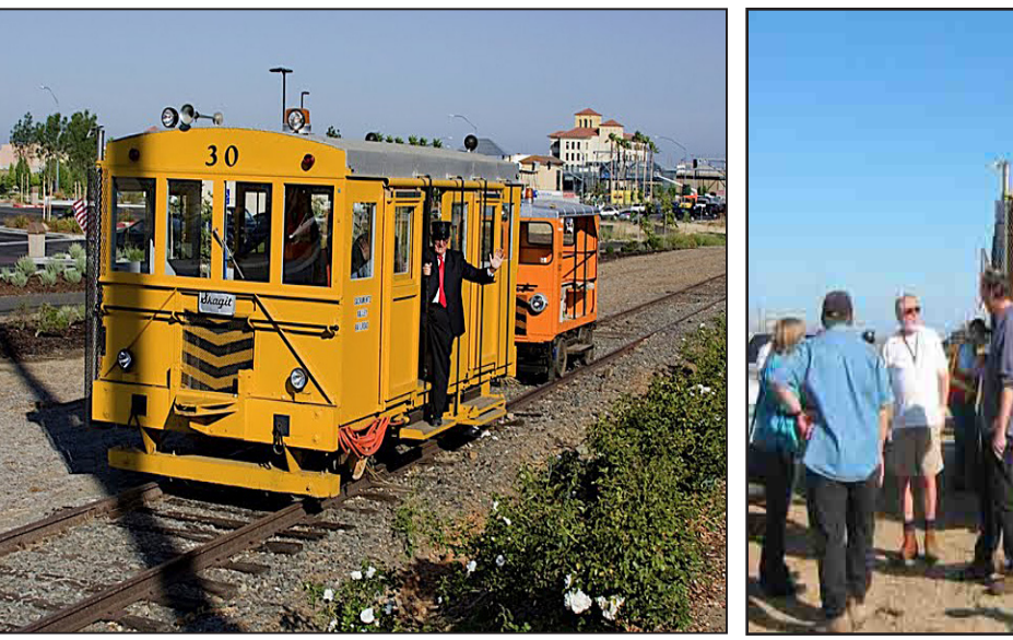
The Skagit motorized railroad car arrives at the boarding area in preparation for the historic run to Latrobe