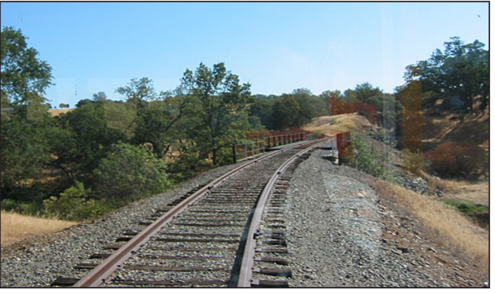
Some of the scenery along the inaugural FEDS train trip