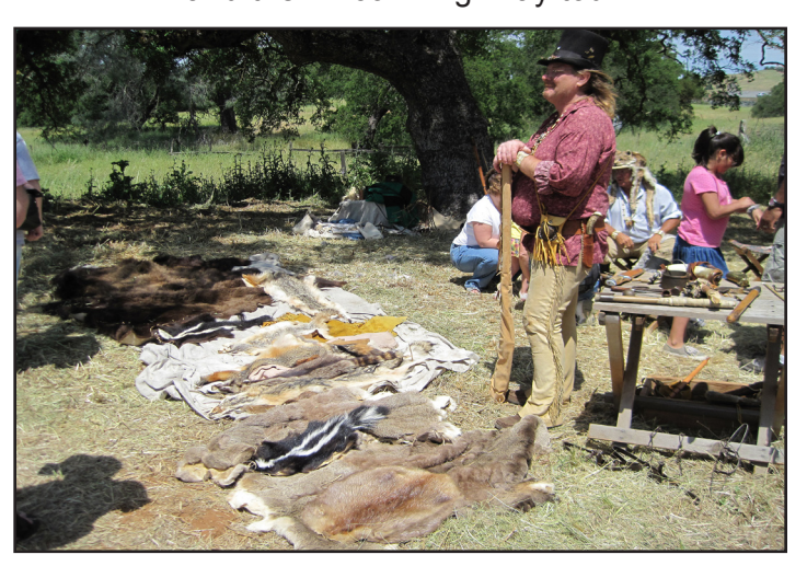
Kit Carson Mountain Men of Amador County exhibit with examples of wild animal pelts and traps