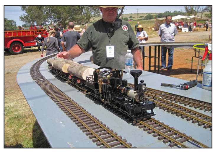
Historic model railroad exhibit with real steam engines by On the Brink, Live Steam Group

The Clarksville Region Historical Society celebrated its Fifth Annual Clarksville Day at the site of Old Clarksville on Saturday May 7. Visitors to Clarksville Day were treated to horse-drawn wagon rides, exhibits of historical nature, and demonstrations of pioneer crafts such as blacksmithing, old-time music, and re-