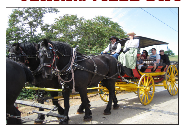
One of the three wagons that offered visitors free rides to and from the parking lot