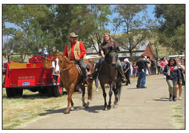
Pony Express equestrians on their horses with the Red Barn in the background

The Clarksville Region Historical Society celebrated its Fifth Annual Clarksville Day at the site of Old Clarksville on Saturday May 7. Visitors to Clarksville Day were treated to horse-drawn wagon rides, exhibits of historical nature, and demonstrations of pioneer crafts such as blacksmithing, old-time music, and re-