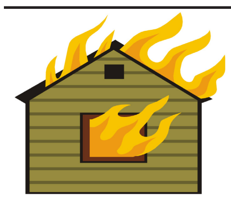
Don't let this be your house!