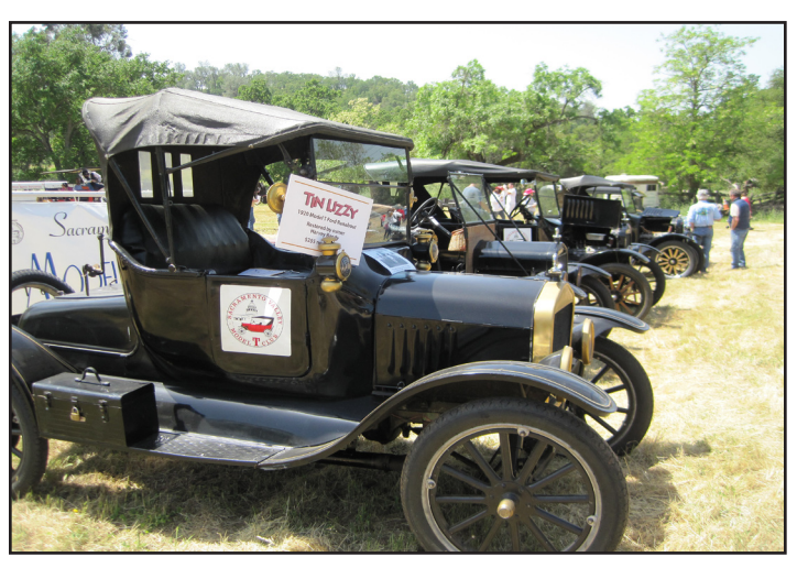
Display by the Model T club after the auto parade and the Lincoln Highway tour