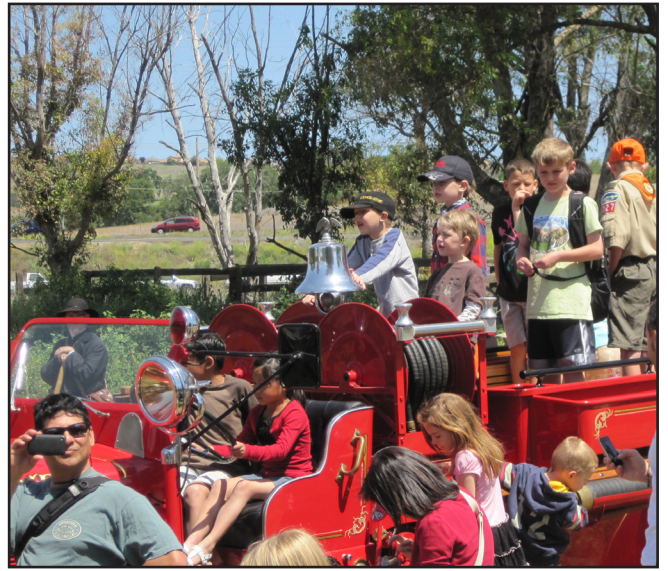
The Rescue Antique fire engine was a big attraction, especially for children, at Clarksville Day