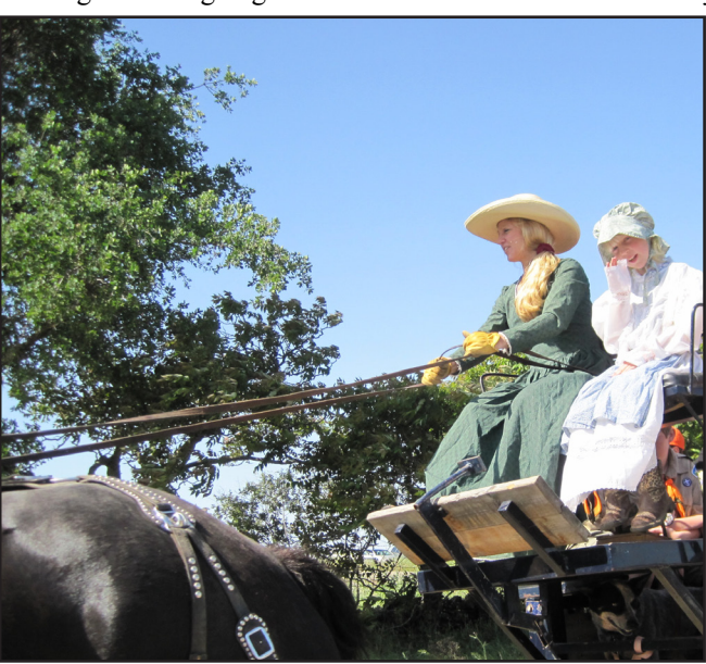
Members of Boy Scout Troop 465 enjoy a wagon ride before taking up their duties as volunteers at Clarksville Day.

In 1848 or 1849, the Mormon Tavern, offering rough hospitality for gold seekers, was built by a Mormon named Morgan in the area just south of the present community of El Dorado Hills. The tavern later acted as a remount station during the short life of the Pony Express, from April 1860