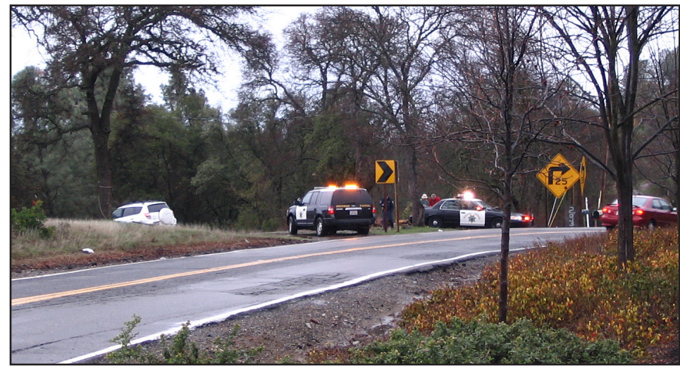
California Highway Patrol cars respond to the latest wreck on Bass Lake Road. The white car off to the left was involved in the collision.