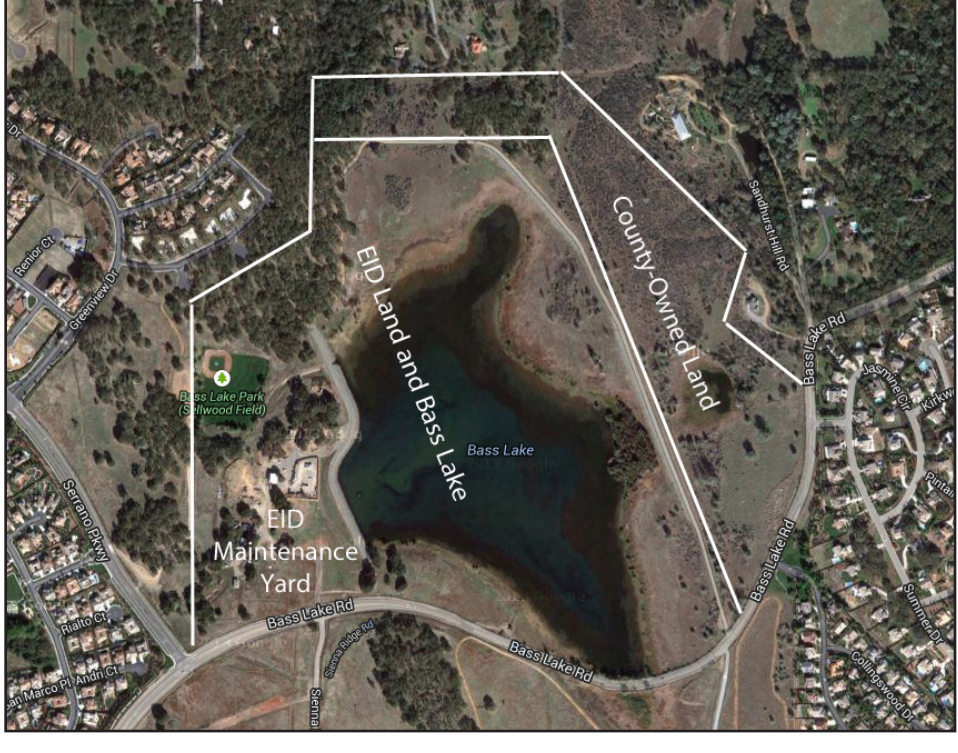
Map showing the roughly 150 acre Bass Lake property on the left and the 41 acre parcel already owned by the county on the right.