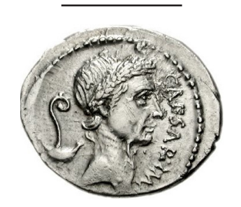
Old Roman coin depicting Julus Caesar

The March 7 price for Bass Lake homeowners who contract with JS West Propane was 2.21 per gallon, based on a fifty-cent markup over the wholesale price plus up to ten cents per gallon transportation charge. Last month at the same time the JS West contract price was 2.50 per gallon. ~