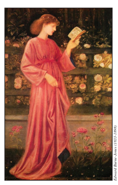
The Year's at the Spring

As before, the information will contain current prices and will be based on local, national and international news and industry sources. The first article will appear in the July Bass Lake Bulletin . ~