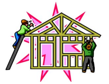
SERRANO'S FINAL HOUSING PROJECT ON HOLD

Wanting to ensure that Serrano Associates complies with everything promised in its development agreement with the county, at the August 8 meeting of the El Dorado County Planning Commission, its members voted to require a compliance audit of the development agreement before approving a tentative subdivision map for the Serrano Village J7 project.