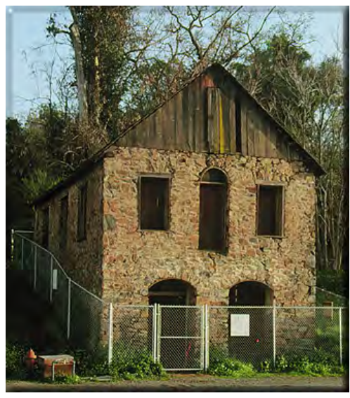
Shingle Springs Wells Fargo Building, Stone House