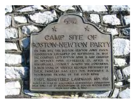
Camp Site of the Boston-Newton Party Historical Marker