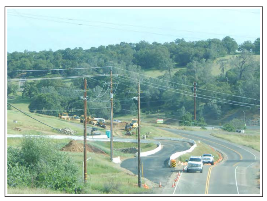
Temporary Bass Lake Road Detour under construction