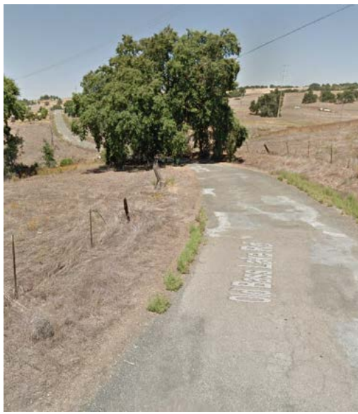
Old Bass Lake Road in EDH, just west of the current Bass Lake Road

The toll bridge no longer exists but remains of it can still be seen along the banks of the North Fork.