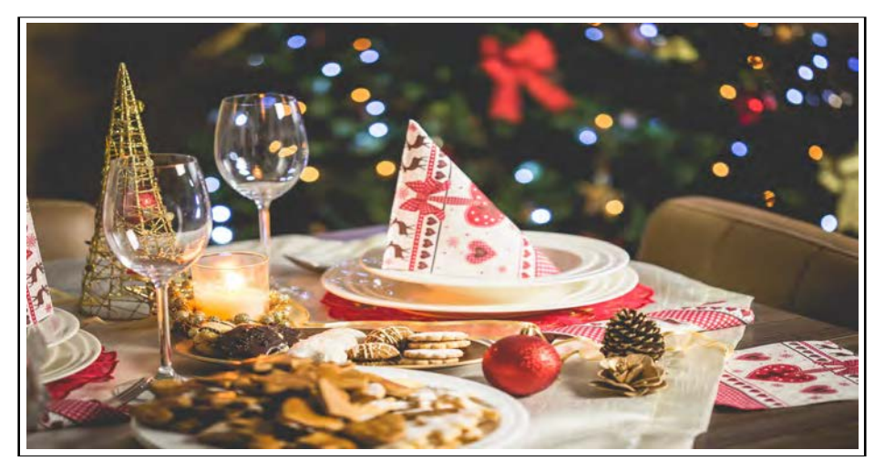
2020 ANNUAL HOLIDAY PARTY DELAYED... UNTIL 2021