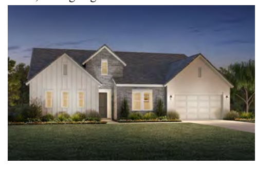
The Olympus - 2 story, 4022+ sf, 5 bedroom, 4 ½ bath, 3 car garage