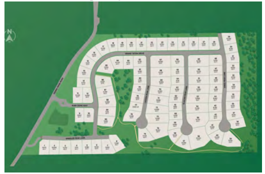
Hidden Ridge 90 home lot map: Sienna Ridge Rd at Hawk View Rd

Prices are starting at the upper $900,000 range. Toll Brothers indicates that their on-site Sales center will be opening soon.