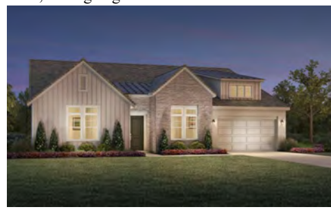
The Sierra - 1 story, 3013+sf, 4 bedroom, 3\frac{1}{2} bath, 3 car garage

The Granite - 1 story 3006+ sf, 4 bedroom, 3 ½ bath, 2 car garage