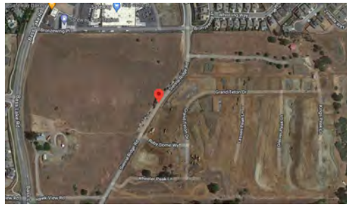
Click Image to load a larger map

Street names inside the gated project include: Wheeler Peak LN, Ruby Dome WY, Grand Teton DR, Lassen Peak LN, Glacier Peak LN, and Kings Peak LN.